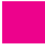
MAGENTA - 72%