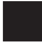
BLACK - 32%