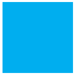
CYAN - 100%