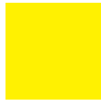
YELLOW - 0%